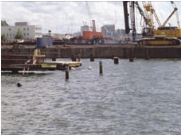
Steel cassetions ready to receive Barchip reinforced concrete