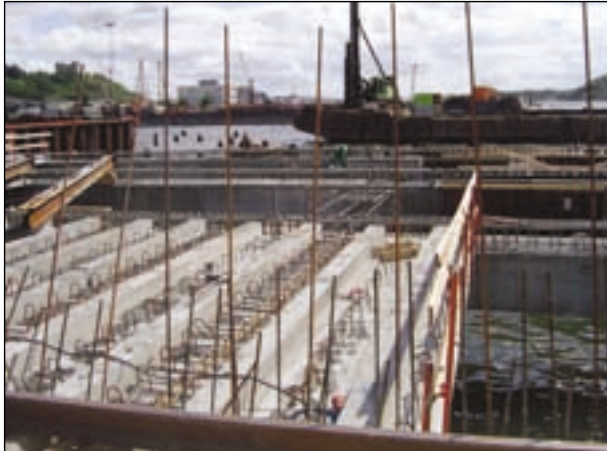
Concrete decking in place.