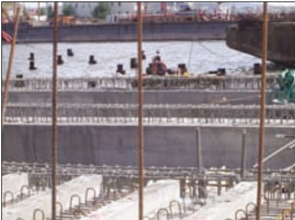
Background: Completed insitu piles Foreground: Insitu piles complete with concrete beams ready for decking.