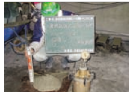
Quality control of fibre reinforced concrete at the project site